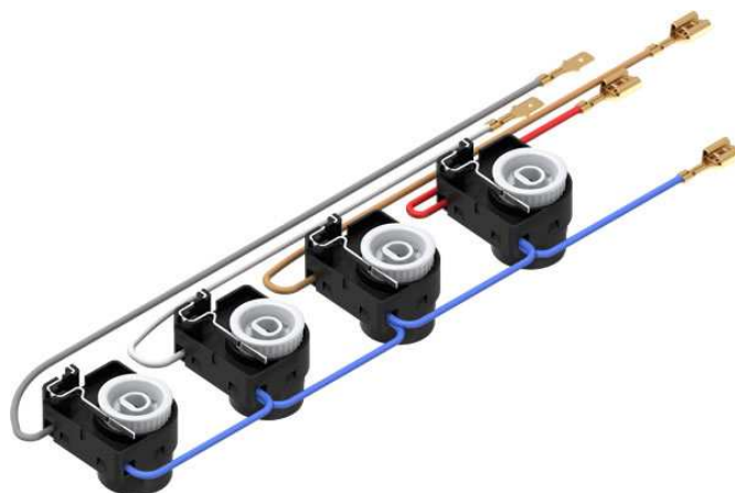
Example of chain