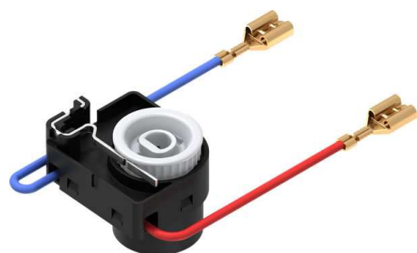
Switch Type 062